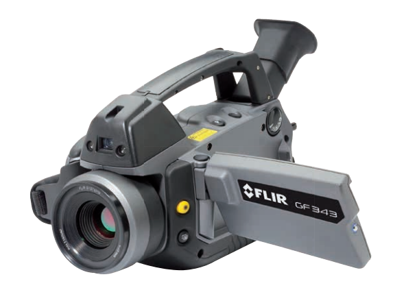
Spot hard-to-find CO2 leaks