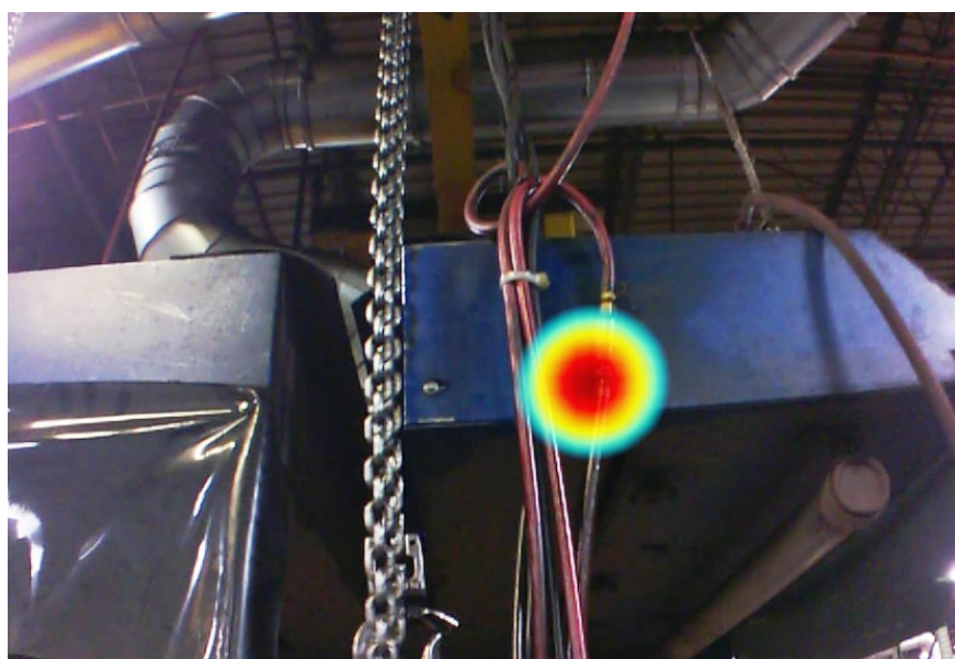
Images taken with the ii900 Sonic Industrial Imager in an industrial environment.

Fluke. Keeping your world up and running.®