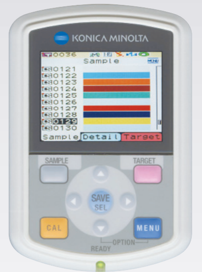
Color difference graph