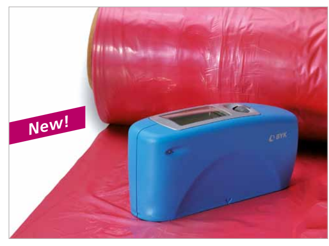
micro-gloss 45°: Specialized glossmeter for ceramics, plastics and plastic films.