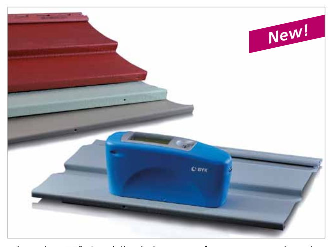
micro-gloss 75°: Specialized glossmeter for paper, paperboard and structured plastic e.g. vinyl siding.