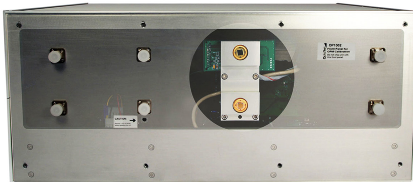
Model OP1302 Automated Optical Power Meter

The OP1302 houses an optical detector pair mounted on a linear movable stage with absolute position encoding. It features a removable front panel for customized port type, count, and positioning.