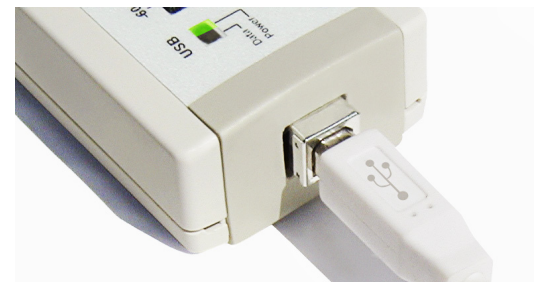
USB-powered and controlled